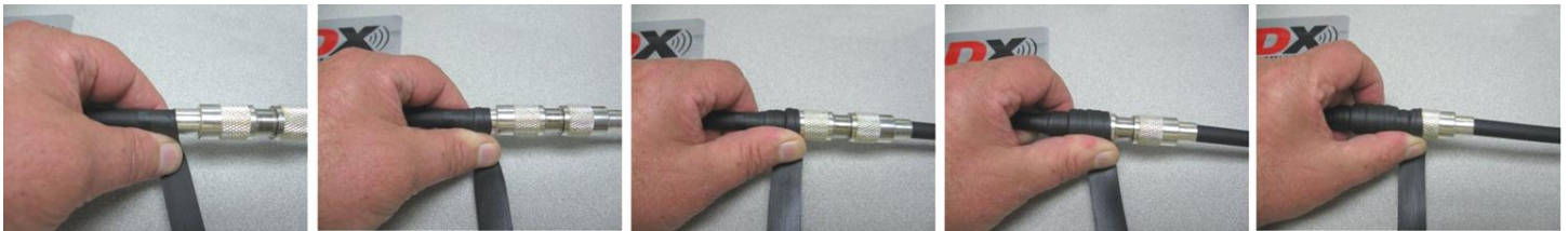
Stretched while overlapping wraps